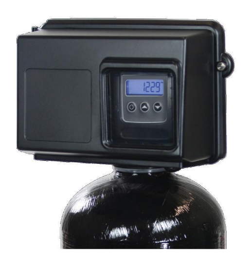
Fig 1 - AIO 2510 SXT Control Valve, Front View

The Air Charger AIO Filter, when properly applied, is an efficient and cost effective system for the removal of iron and Iron. The AIO control valve maintains a compressed "air pocket" in the top of the tank while the system is in service. As the water passes through the air pocket, iron and Iron are oxidized. Additionally, dissolved oxygen is added to the water. The Air Charger AIO filter media bed then removes the iron and Iron from the water.